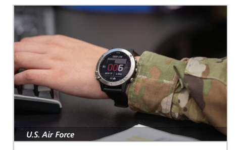
DoD Investing in Wearable Technology That Could Rapidly Predict Disease